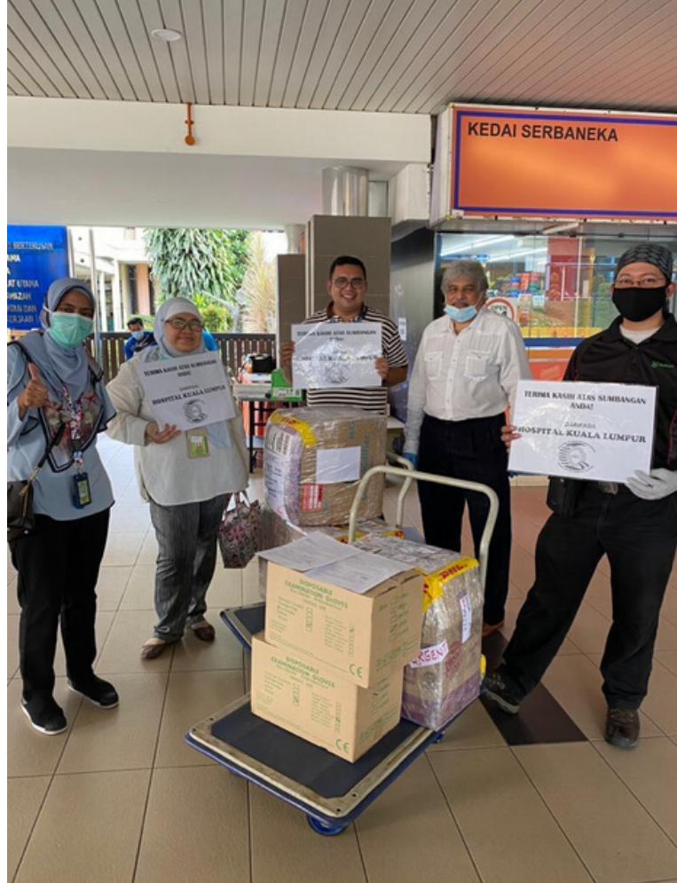
Supplies donated to Sg.Buloh Hospital & Kuala Lumpur Hospital ( HKL) : 28th March 2020.